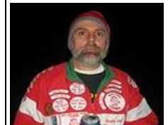
Web Wanker Double Dick