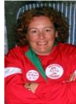
On Sex / Hash Trash Snail Trail