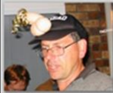
Hash Flash Toe Knee Hand Cock