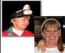
HashCash Tranny / Vibrator