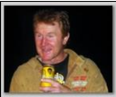
Grand Master Greasy Box