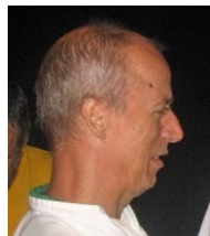
Hash Horn Batman