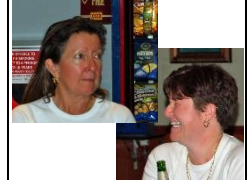
BrewMaster Tea Bags/ Lady Grey